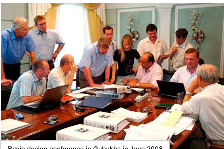
Basic design conference in Gubakha in June 2008

To coordinate all parties requires a lot of time and work, but is gladly carried out. The Pörner slogan 'out of one hand' fully applies in this respect. It goes without saying that Metafrax is provided with comprehensive services from one