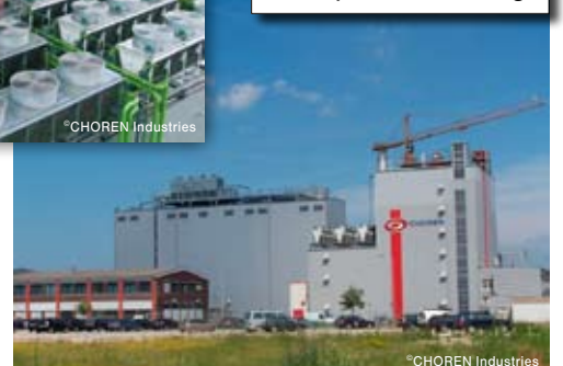
Exterior view of the Beta plant in Freiberg