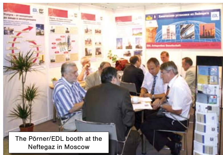
The Pörner/EDL booth at the Neftegaz in Moscow

Pörner's current strategy is to act together with EDL on the Russian market. EDL's complete service portfolio combined with know-how gained in many