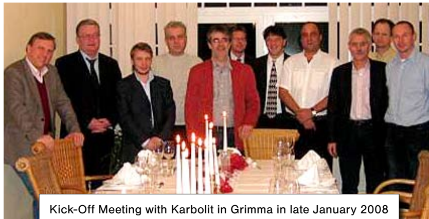
Kick-Off Meeting with Karbolit in Grimma in late January 2008

The project having an investment value of more than EUR 12 million has been under construction since June. Equipment and material deliveries have already started and will be finished by the end of October so that the plant can be commissioned in 2 nd quarter 2009 as scheduled. Therefore, the ambitious project duration of only 16 months can be adhered to. ■