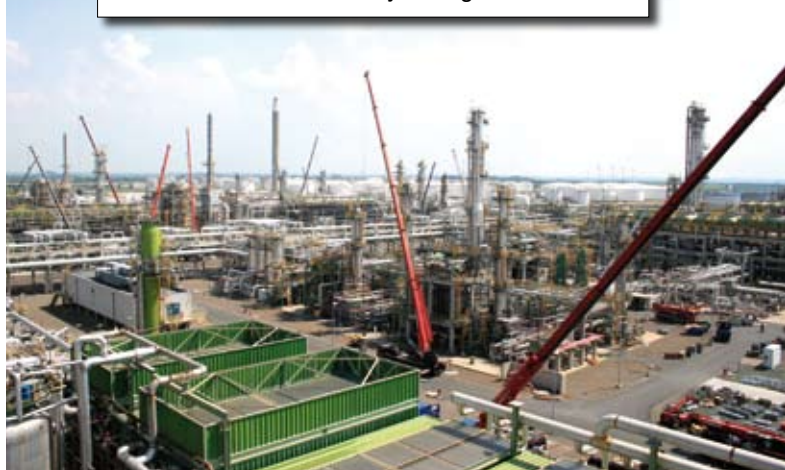
View over TOTAL Refinery during the shutdown