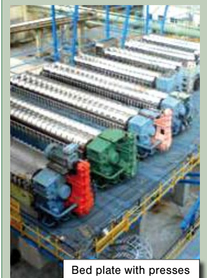
Bed plate with presses being installed

The bed plate was designed by Pörner + Partner as reinforced concrete structure. In addition to this, the project required a quite complex structural engi-