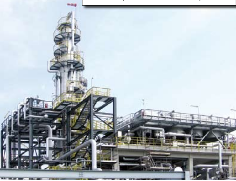
The HDS 1 plant shines in new resplendence

Schwechat Refinery. The objective was to reduce the sulphur