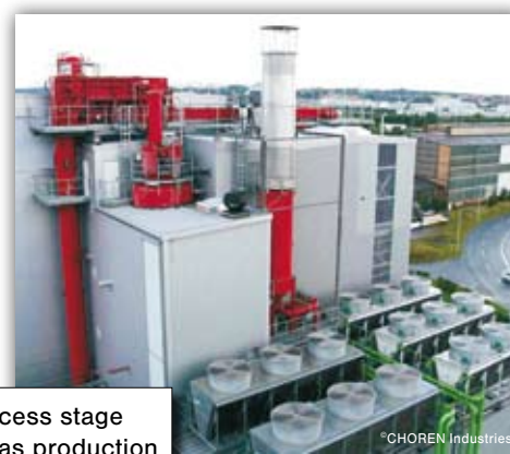
First process stage Carbo-V®-gas production

Now, CHOREN and EDL intensively work on the completion of the plant together with Shell that has been supporting the CHOREN process as technology partner and since 2005 also as investor.