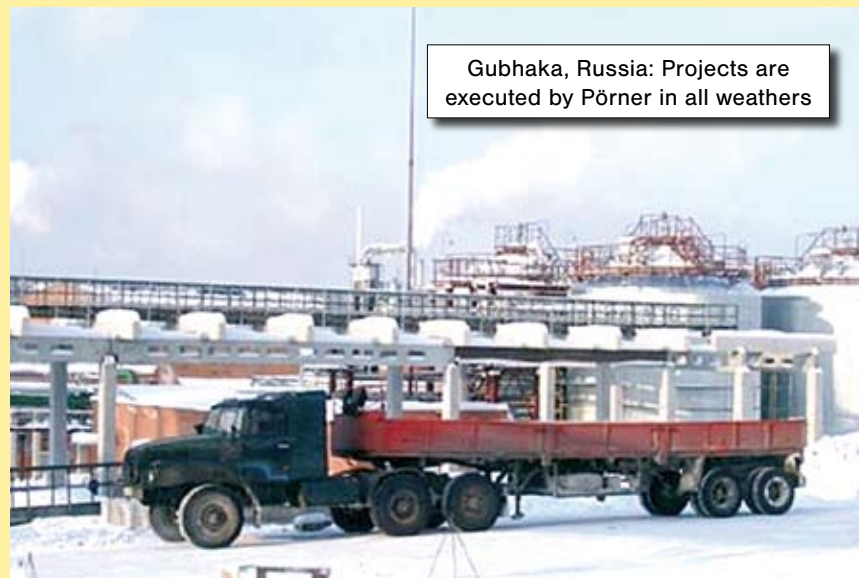
Gubhaka, Russia: Projects are executed by Pörner in all weathers

As regards the latter item the so called GOST-R certificate is