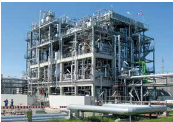
Fig. 1: Propane deasphalting plant (PDA), H&R Ölwerke Schindler GmbH, Hamburg, Germany

In Solvent Deasphalting asphaltenes are removed from the feedstock in an extraction column. The resulting deasphalted oil (DAO) undergoes further processing to become base oils or fuels. The produced high-asphalt pitch can be processed to bitumen by the Biturox® process or blending, depending on the residue used and bitumen quality needed.