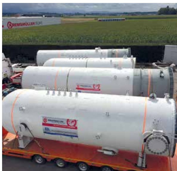
Fig. 4: OAO Naftan, Novopolozk, Belarus: Engineering and delivery of two extractors for conversion of PDA plant

H&R Ölwerke Schindler GmbH, Hamburg: new PDA plant and extension