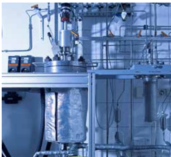
Fig. 3: Pilot plant of EDL based in Leipzig, Germany