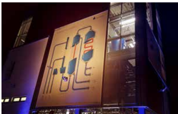
Fig. 2: Pilot plant at Sunfire

The SOEC electrolysis of H 2 O is currently being further developed to co-electrolysis of H 2 and CO 2 and is going to replace (from 2020 expectedly) the two-stage synthesis gas production by one process step thus saving costs of investment and operation.