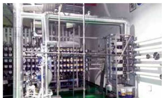
Lube oil blending plant with Simultaneous Metering Blender (SMB) and Dosing Manifold for automatic production of up to 40 batches per day. GS Caltex Corporation, Seoul / South Korea, 2015.