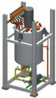
View of an ABB

The Drum Decanting Unit (DDU) is designed for automatic and high-precision decanting and metering of additives from drums.