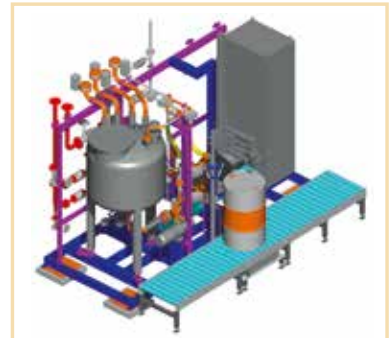
View of a DDU

The Automatic Batch Blender (ABB) is used in the batch-type production of special products by blending different additives with base oils.