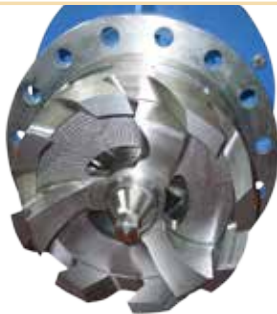
View of a VI mixer

The Simultaneous Metering Blender (SMB) and Inline Blender (ILB) serve for the continuous production of mass products by high-precision metering of additives to a base oil flow.